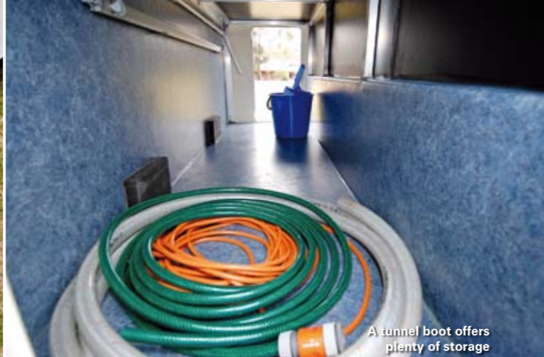
A tunnel boot offers plenty of storage