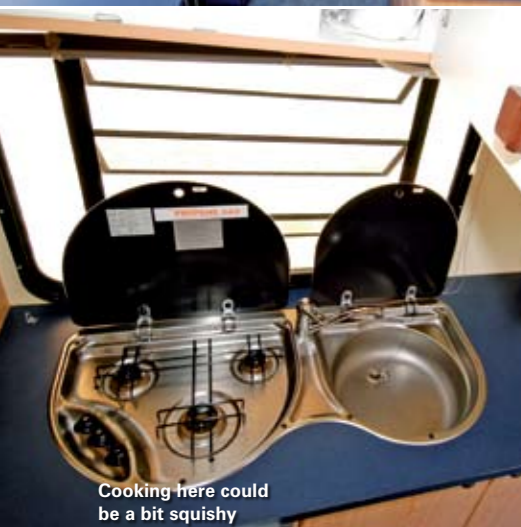
Cooking here could be a bit squishy

Sometimes simplicity is the way to go for longevity, and that's what you get with this Apollo. On the passenger side of the body there is one door to secure the twin 4kg gas bottles, and another to access the full-width tunnel boot at the rear of the unit. The entry has a drop step, door light and security door, with a Fiamma awning and an awning light also fitted on the passenger side.