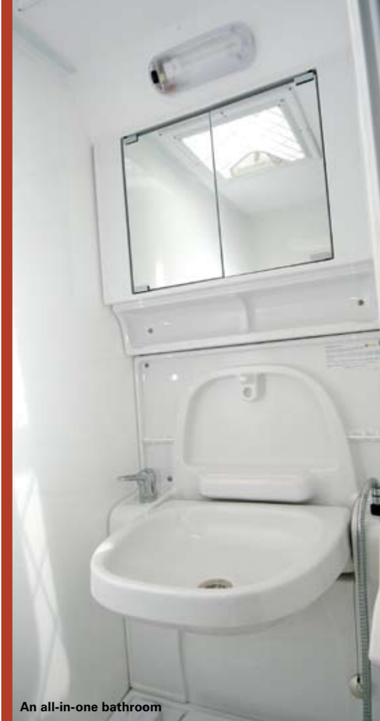
An all-in-one bathroom

There's a lot to be said for the 'try before you buy' scenario. A six-berth motorhome may not be everyone's first choice, but for a family of four or more, it offers plenty of sleeping space and internal room for everyone to have a space of their own.