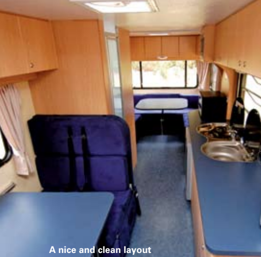
A nice and clean layout