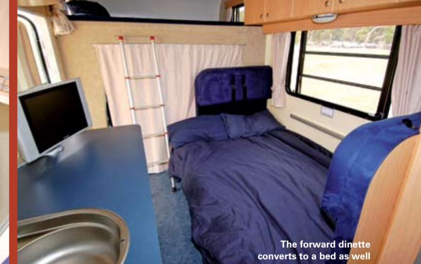
The forward dinette converts to a bed as well

T he hire company, Apollo, started back in 1985 with one vehicle available for hire over the weekends. Since then, the company has grown to include nine offices around Australia and two in New Zealand. The company employs around 150 people, which is an amazing leap from where it began just over 20 years ago. This family-owned business has around 1500 vehicles on the books, which range from 2WD cars to 4WD campers and the six-berth motorhomes such as the one we are reviewing.