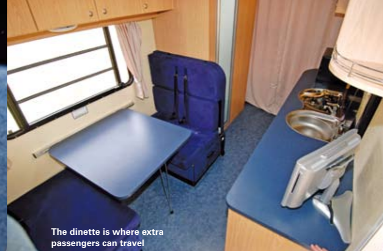
The dinette is where extra passengers can travel