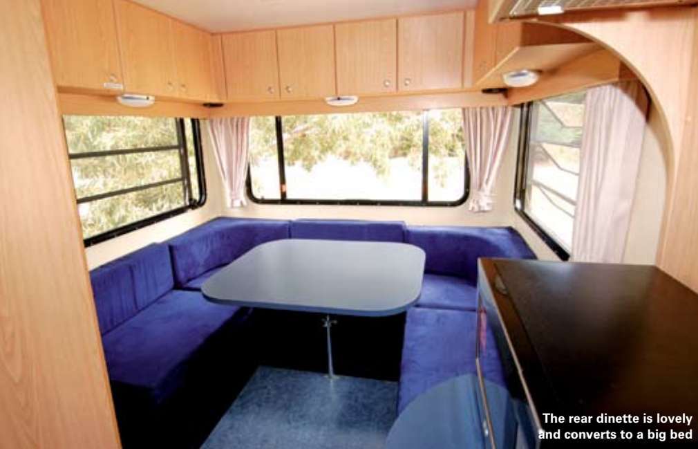
The rear dinette is lovely and converts to a big bed

The beauty of the hire experience really boils down to the fact that if it is a great success, the customer knows exactly what will work and what ideas they may be able to change to suit the individual lifestyle. At this point, Talvor is the place to visit and view the expanded range on offer for sale.