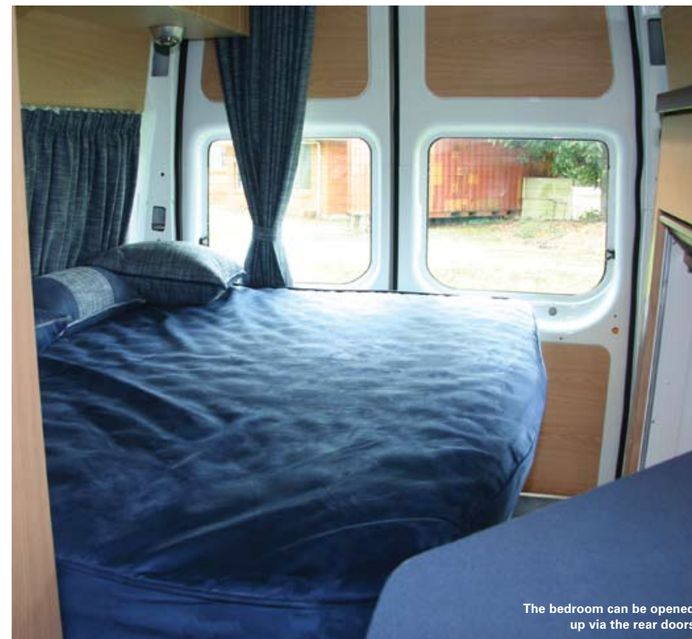
The bedroom can be opened up via the rear doors

There's a lot to be said for touring Oz in a relatively small motorhome. Fuel consumption is one factor, manoeuvrability another. Then, of course, there is the initial outlay. We'd all like a mega motorhome with more bells and whistles than a Packer mansion, but given today's economic fragility, particularly as far as it affects superannuation, the dollars involved in a highway yacht are well beyond most of us.