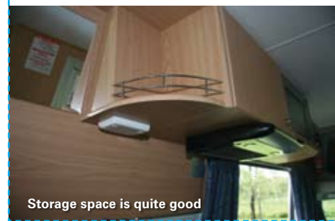
Storage space is quite good