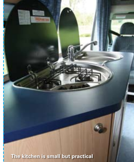
The kitchen is small but practical