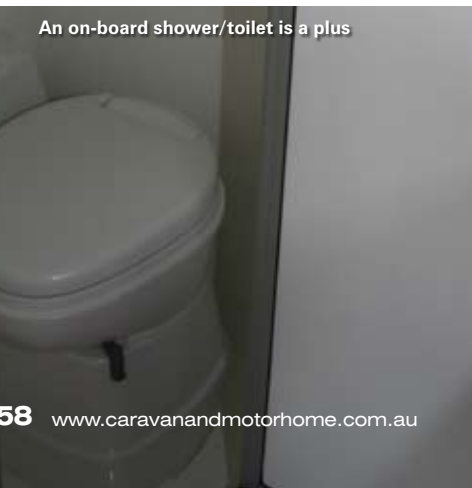
An on-board shower/toilet is a plus