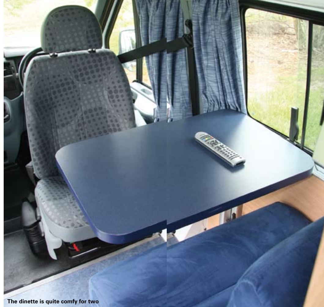
The dinette is quite comfy for two