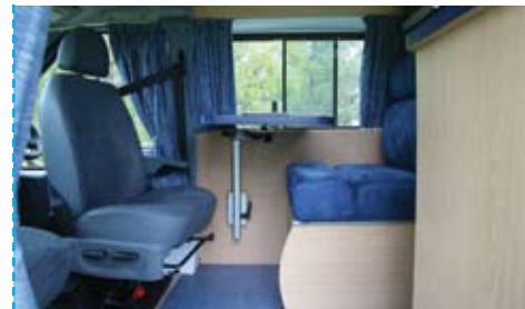
The driving compartment is comfortable